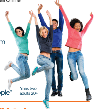
*max two adults 20+

unlimited travel, all day for up to 5 people*