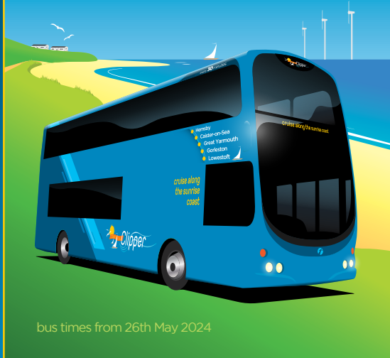
bus times from 26th May 2024